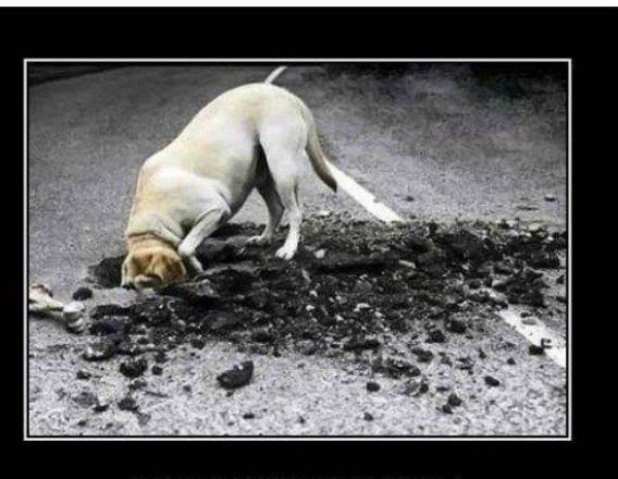
PERSISTENCE Sometimes you've got to dig a little deeper...